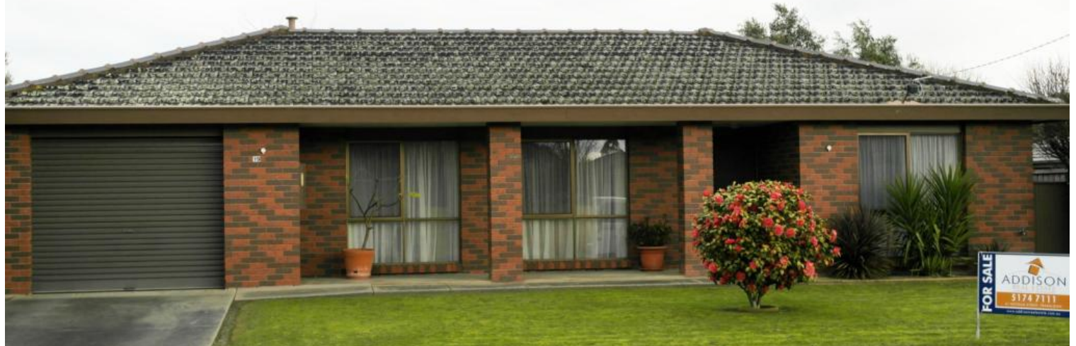
19 Laurence Grove, Traralgon