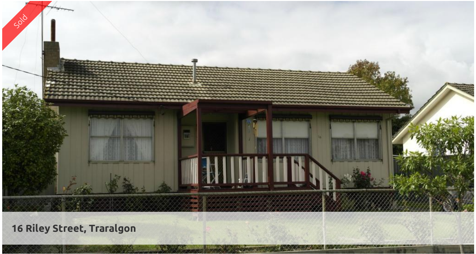
16 Riley Street, Traralgon