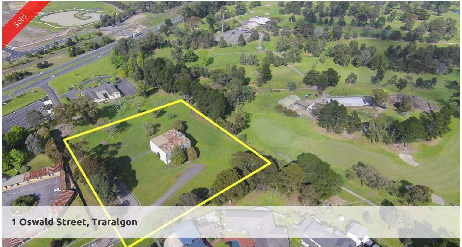
1 Oswald Street, Traralgon