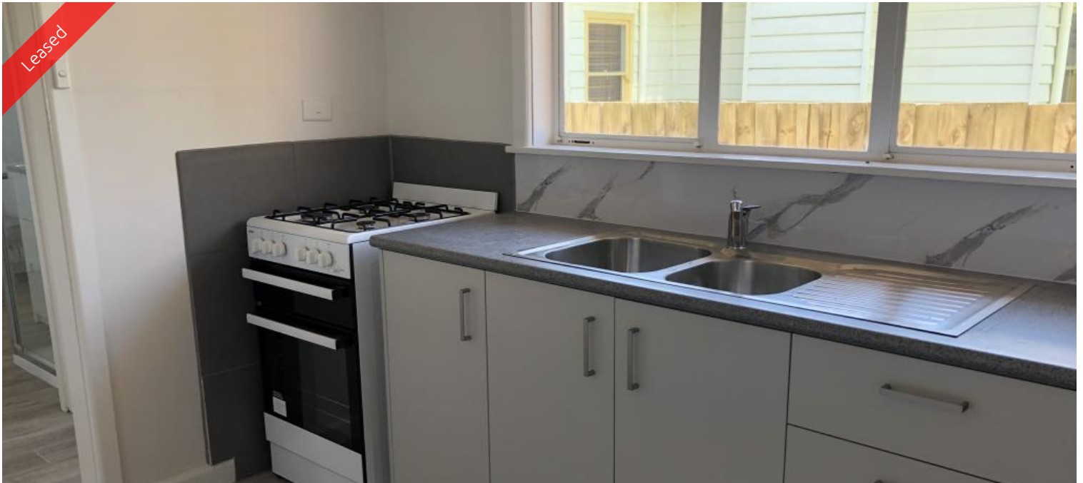
Unit 3, 25 Peterkin St, Traralgon