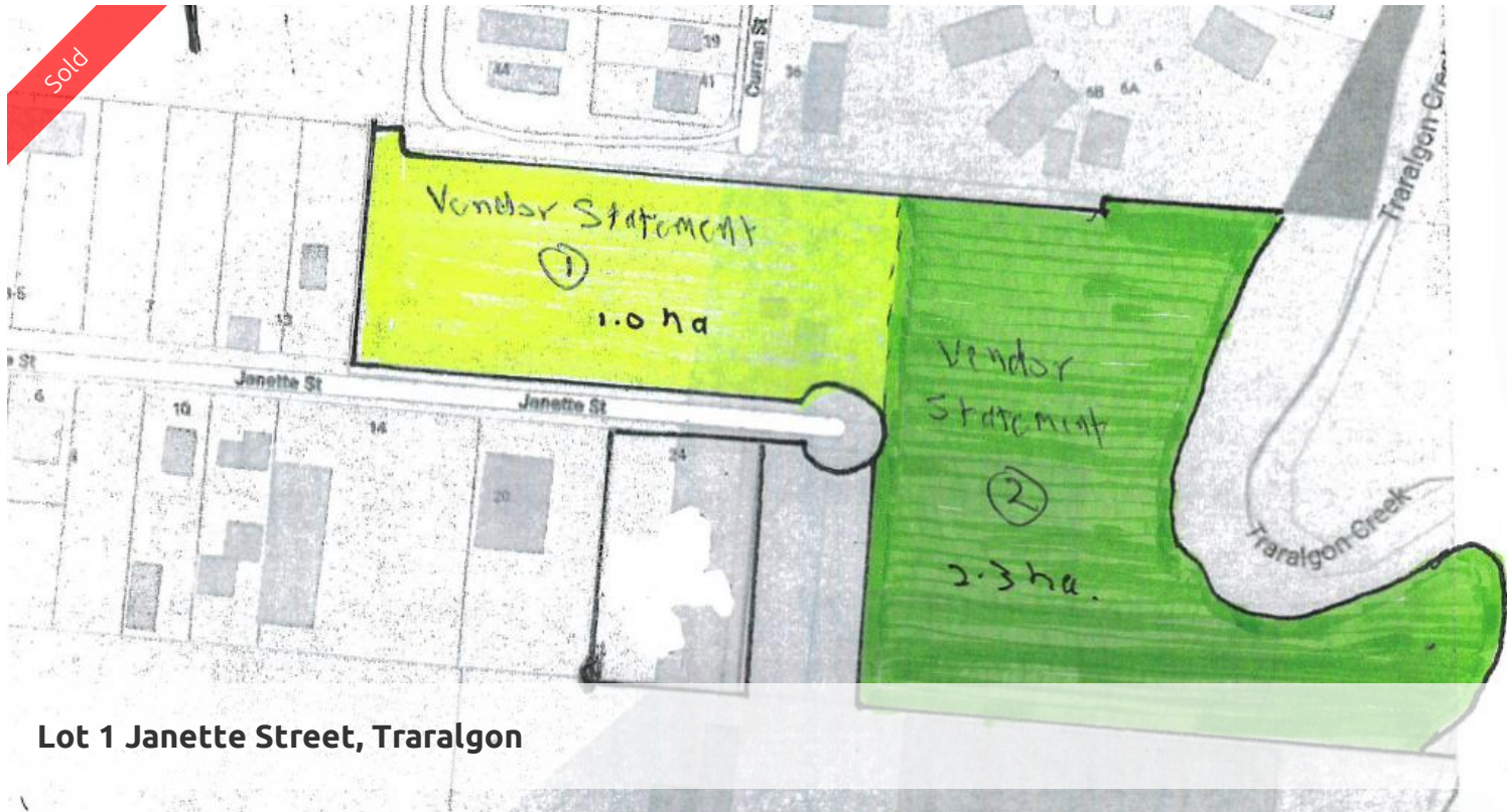
Lot 1 Janette Street, Traralgon