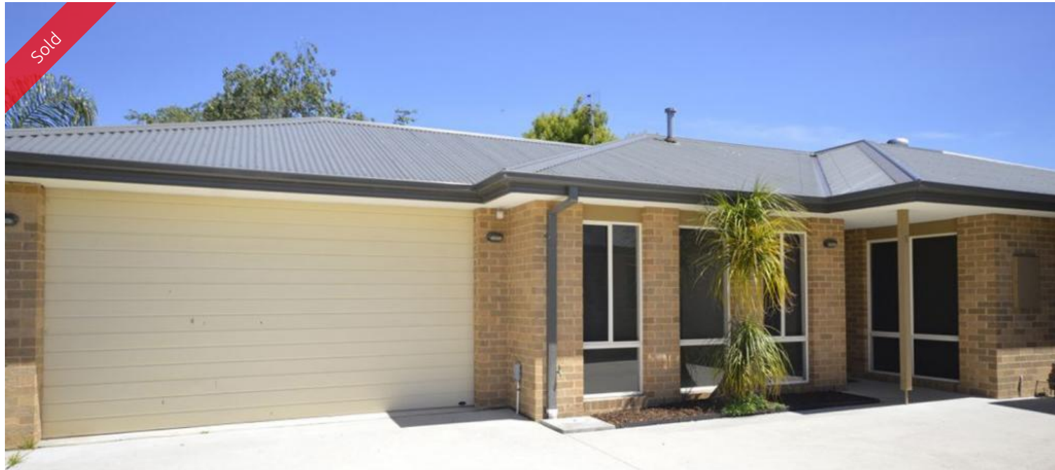
Unit 2, 9 Davis Ct, Traralgon