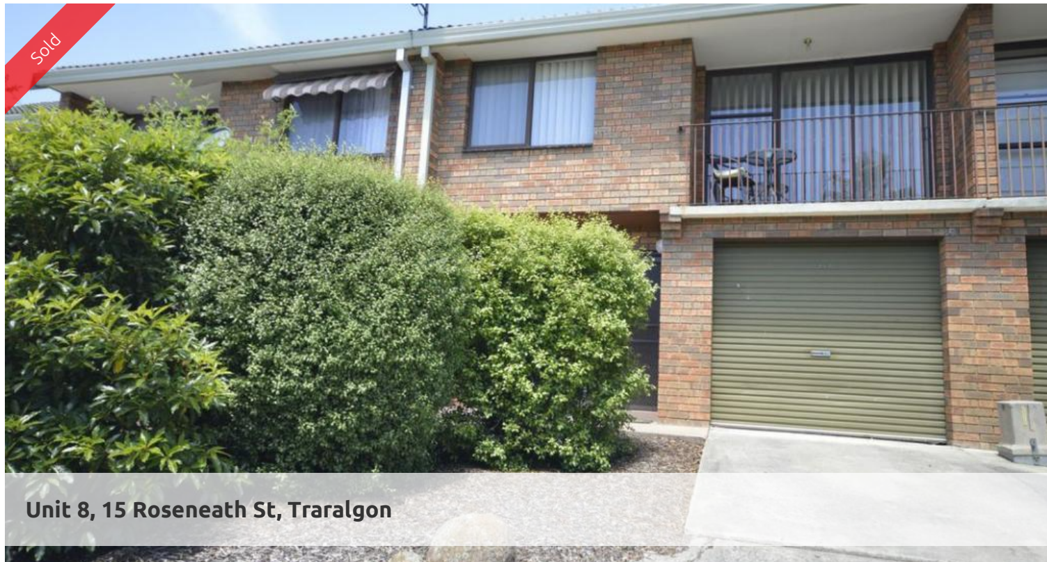
Unit 8, 15 Roseneath St, Traralgon