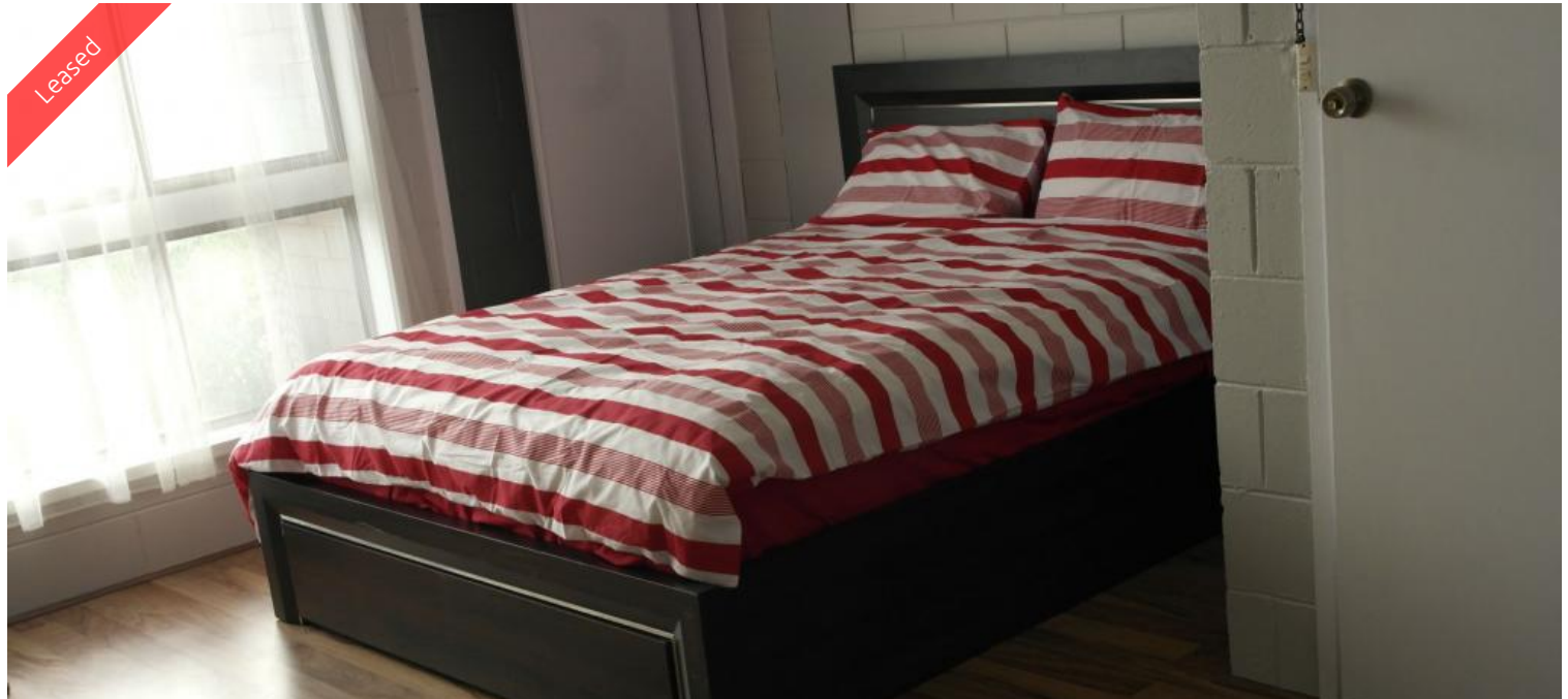
Unit, 39 Wigg Close, Traralgon