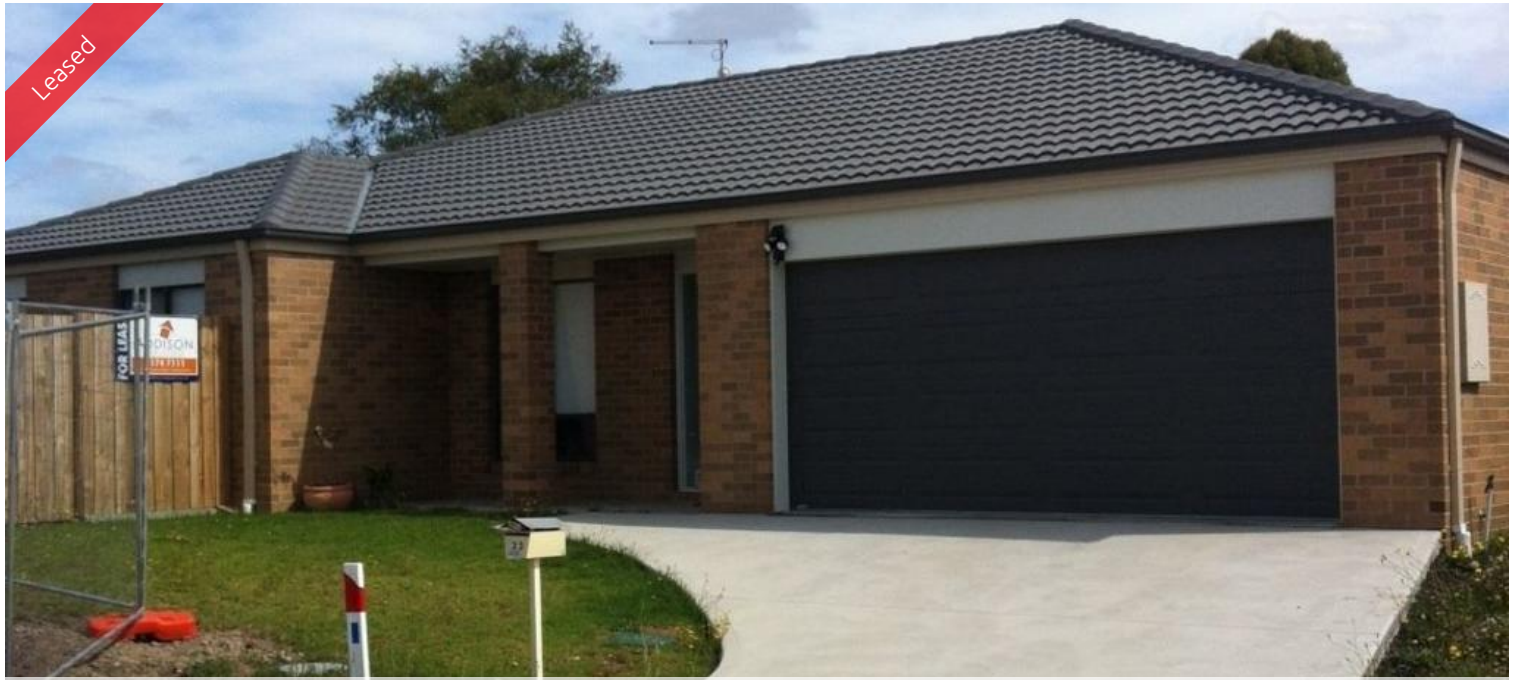
23 Graduation Place, Churchill