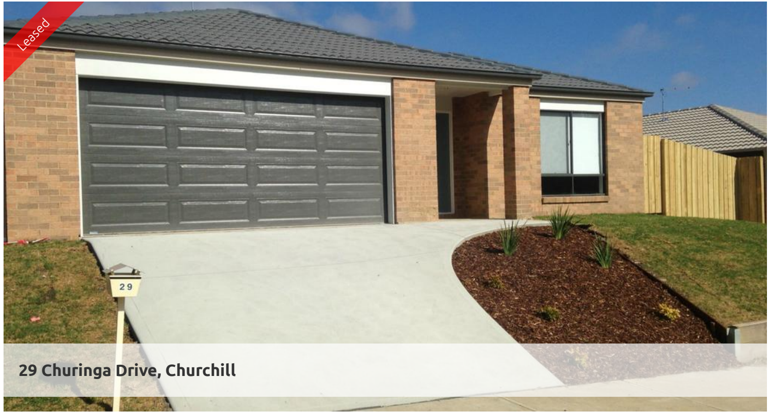
29 Churinga Drive, Churchill