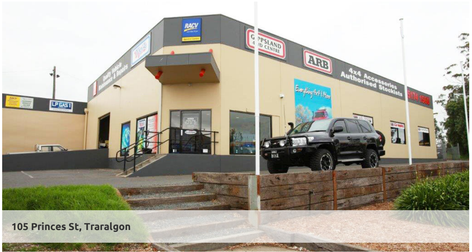
105 Princes St, Traralgon