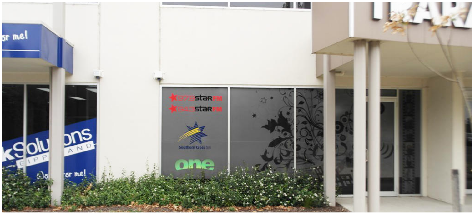
Suite 2, 55 Grey Street, Traralgon