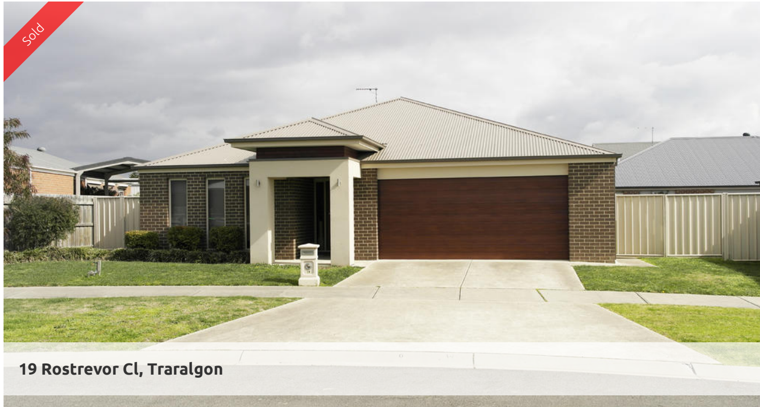
19 Rostrevor Cl, Traralgon