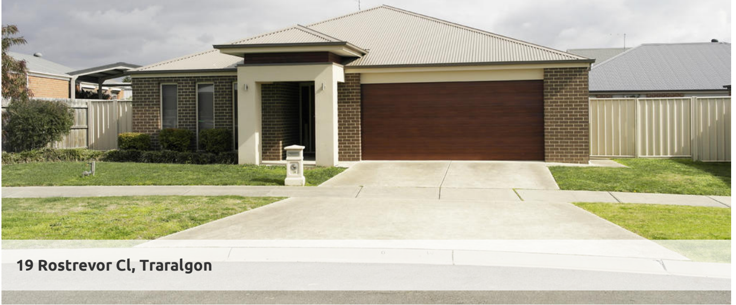
19 Rostrevor Cl, Traralgon