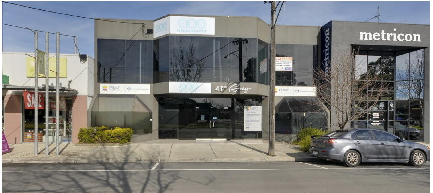
Suite 2, Level 1, 41 Grey Street, Traralgon