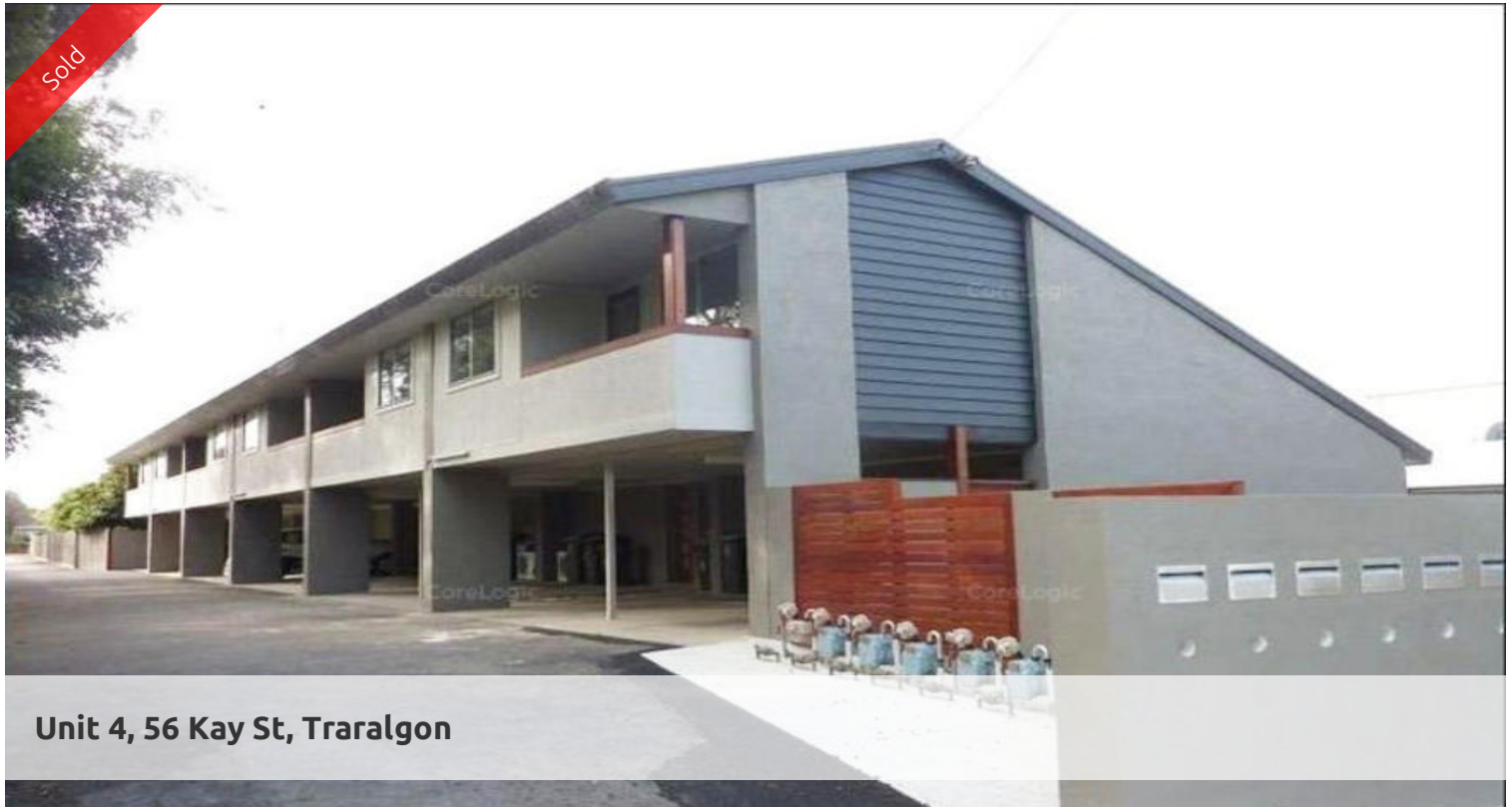
Unit 4, 56 Kay St, Traralgon