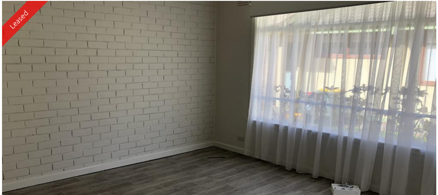
Unit 4, 25 Peterkin St, Traralgon