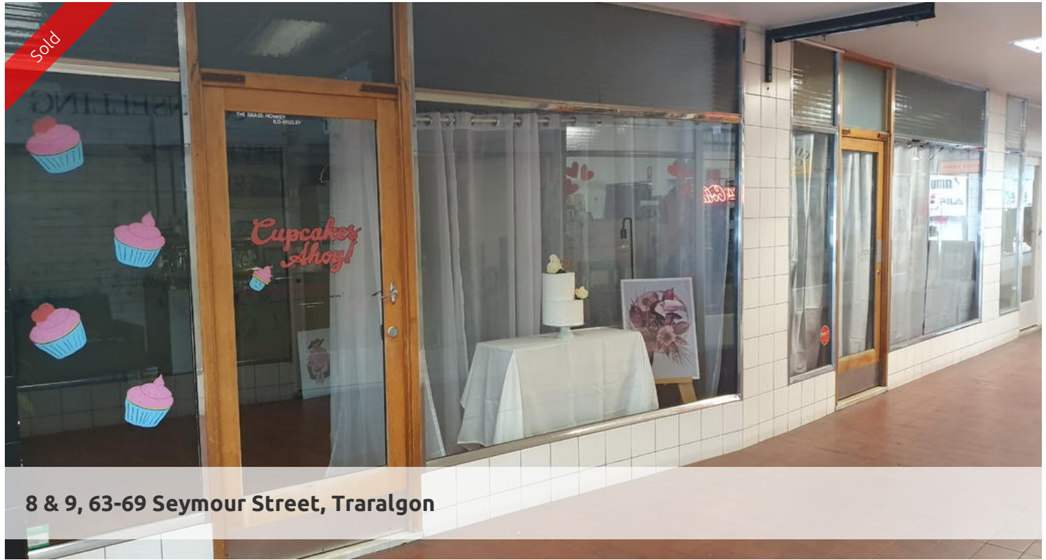
8 & 9, 63-69 Seymour Street, Traralgon