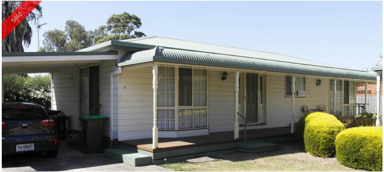
Unit 7, 4-6 Smith St, Traralgon