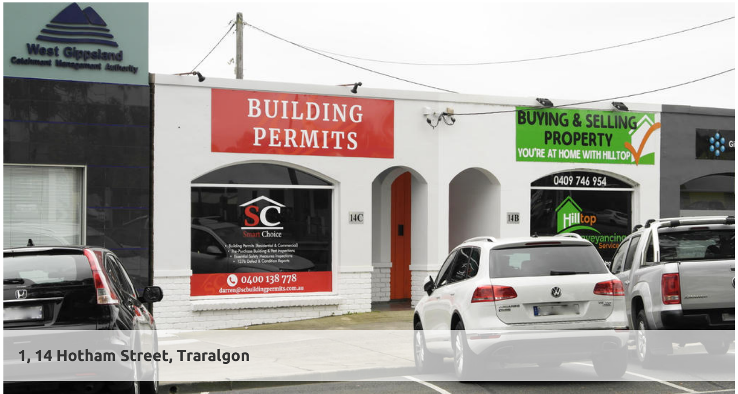
1, 14 Hotham Street, Traralgon