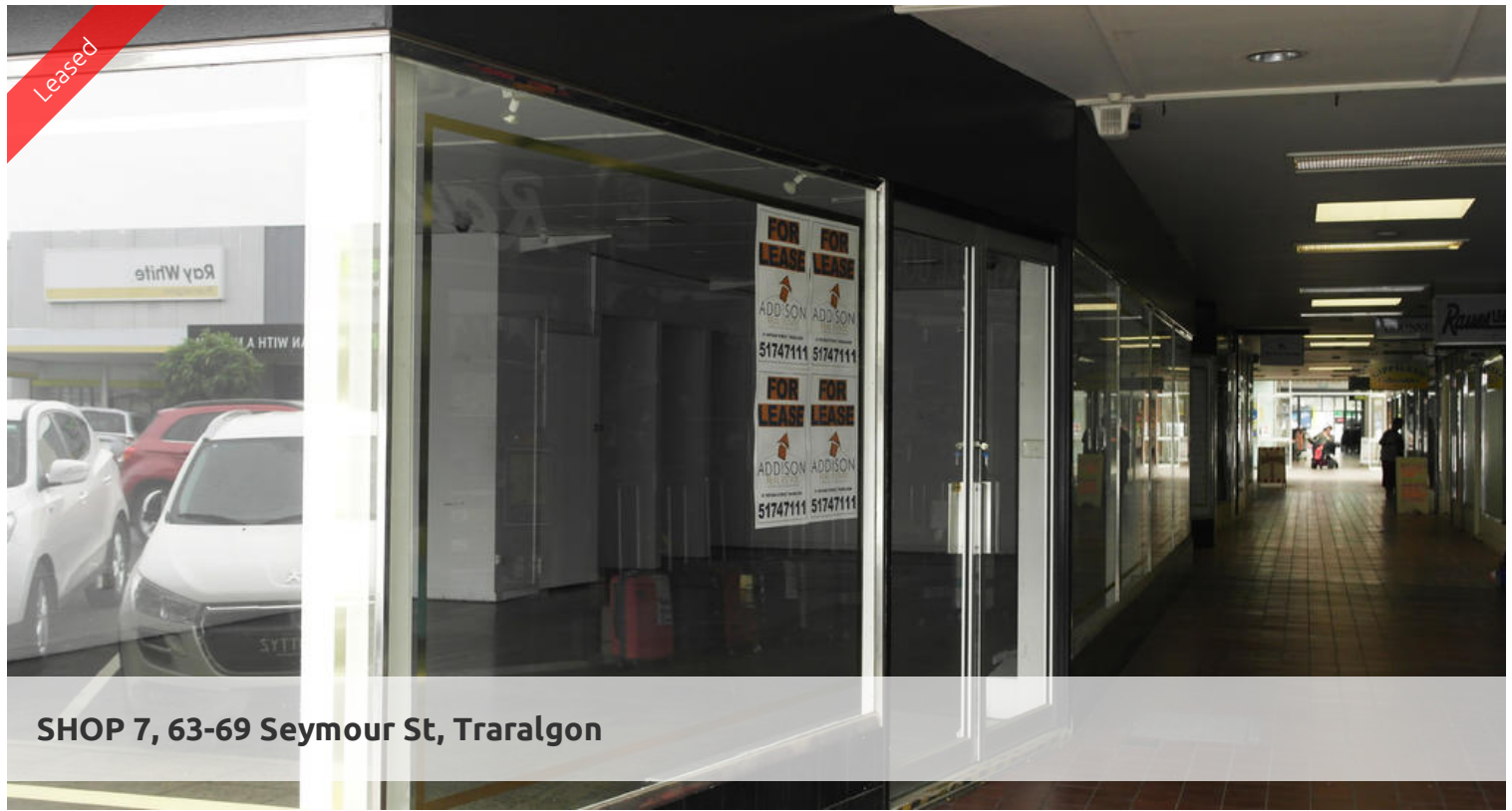
SHOP 7, 63-69 Seymour St, Traralgon