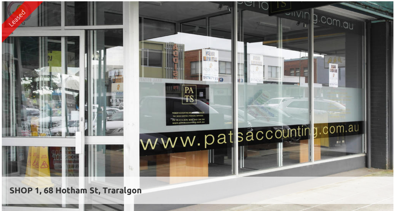
SHOP 1, 68 Hotham St, Traralgon