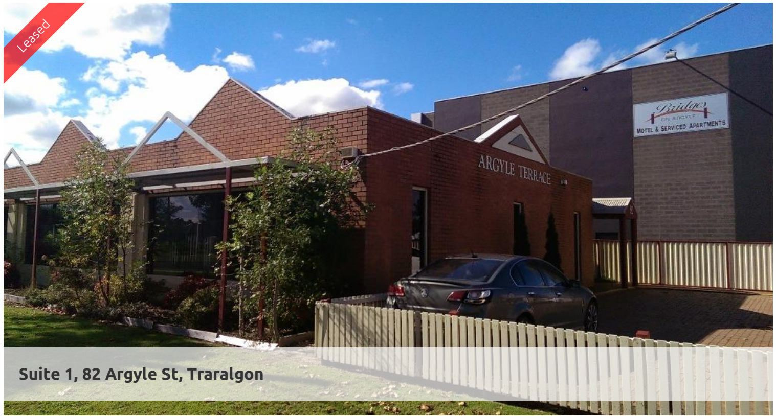
Suite 1, 82 Argyle St, Traralgon