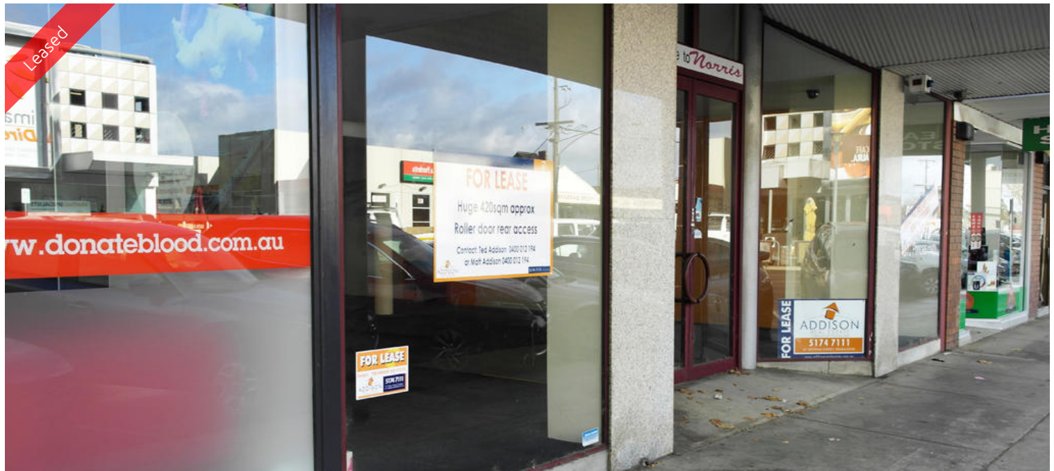
18 Seymour Street, Traralgon